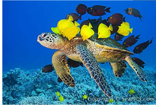
Green sea turtle